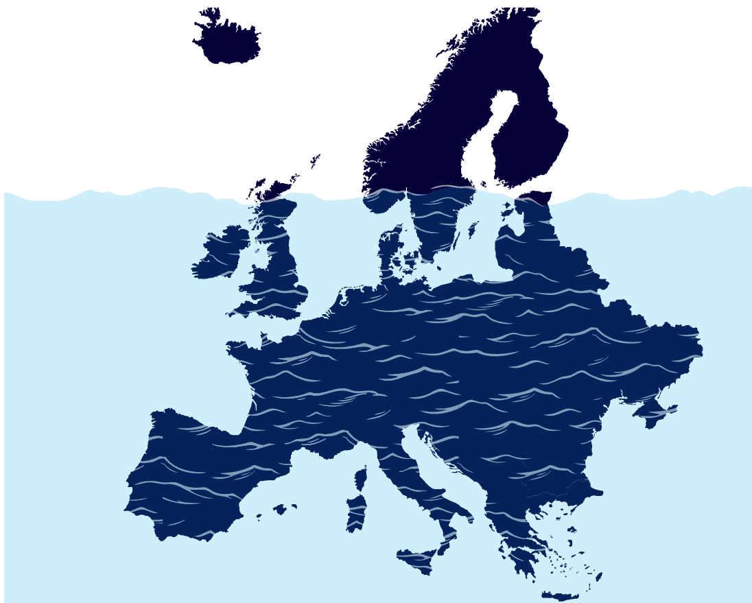
Figure 2: On exchange liquidity is only the tip of the iceberg and most of Europe's volume is 'under water' in the OTC market