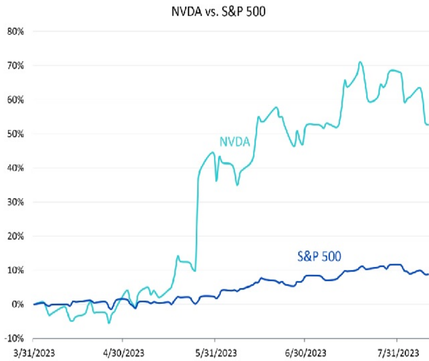
Figure 1: Comparative performance of Nvidia vs S&P 500 from 31 March to 10 August 2023

Historical performance is not an indication of future performance and any investments may go down in value.