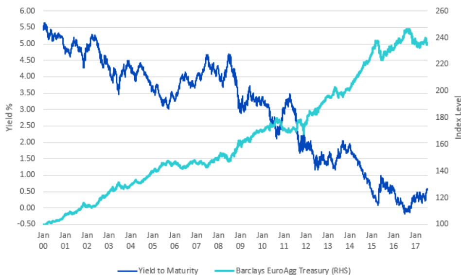
Chart 1: Euro government bonds at close to all-time highs

Markets have already had a sharp correction from the unparalleled instances of 10-year Bund yields hitting a low of -0.2% in early July 2016. Since its peak in early August 2016, the Bloomberg Barclays Euro Aggregate Treasury Index has fallen by over 4.1%. This contrasts with overall annualised returns of over 4.8% that investors have enjoyed from 1998 to the end of 2016.