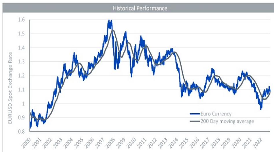
Historical performance is not an indication of future performance and any investments may go down in value

The weakness in eurozone growth alongside resilient US activity (particularly consumption and the labour market) has helped the performance of the US dollar versus the EUR. Despite sticky core inflation in the eurozone, the European Central Bank sounded more dovish at the recent meeting, acknowledging the effect rates were having on broad demand. In comparison, the Fed appears likely to stay on hold for an extended period of time. These factors are likely to pressure the EUR further versus the US dollar and could benefit a EUR based investor invested in WisdomTree USD Floating Rate Treasury Bond UCITS ETF.