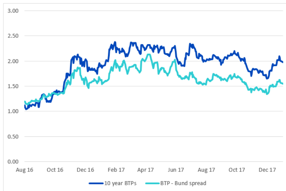
Chart 1: The recent rise in BTP yields

In the recent upward move in yields, in December 2017, ahead of the dissolution of the Italian parliament, the 10 year BTP yield increased from 1.39% to 1.77%, a modest shift of 0.38%. Although this election is unlikely to result in the scale of change expected ahead of the 2016 referendum, it may well prove to be eventful. Risks range from not having a clear winner, a win by the anti-establishment Five Star Movement and the possibility of a coalition between Forza Italia and the Northern League or other centre-right parties.