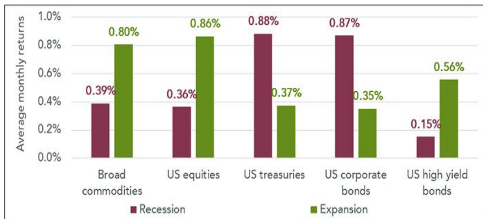
Figure 1: Performance of various asset classes in periods of economic expansion and recession

From January 1960 to January 2023. Calculations are based on monthly returns in USD. Broad commodities (Bloomberg commodity total return index) and US Equities (S&P 500 gross total return index) data started in Jan 1960. US treasuries (Bloomberg US treasury total return unhedged USD index) and US corporate bonds (Bloomberg US corporate total return unhedged USD index) data started in Jan 1973. US high yield bonds (Bloomberg US corporate high yield total return unhedged USD index) data started in July 1983. Expansion and Recession phases are defined using the NBER website.