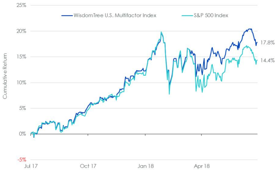
Source: Bloomberg. 30 June 2017 to 30 June 2018.

You cannot invest directly within an Index. Historical performance is not an indication of future performance and any investments may go down in value.