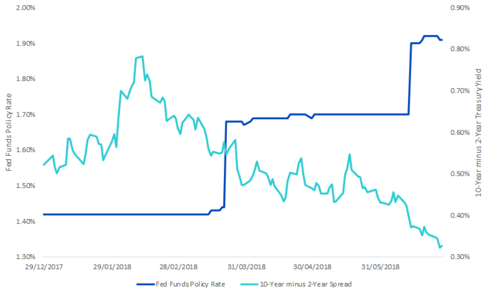
Data is from 29 December 2017 to 29 June 2018.

You cannot invest directly within an Index. Historical performance is not an indication of future performance and any investments may go down in value.