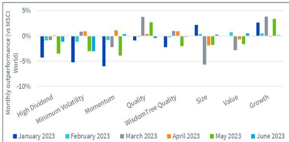
Figure 2: World equity factor outperformance month by month in the first half of 2023

31 December 2022 to 30 June 2023. Calculated in US dollars for all regions except Europe, where calculations are in EUR.